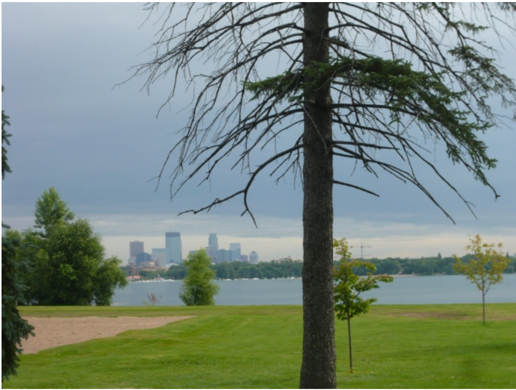
The group Mill City Cyclomaniacs, waiting at our meeting point for the big ride. There were 46 riders in all —Moms, Dads and kids of all ages (with the youngest being my daughter Sophia).