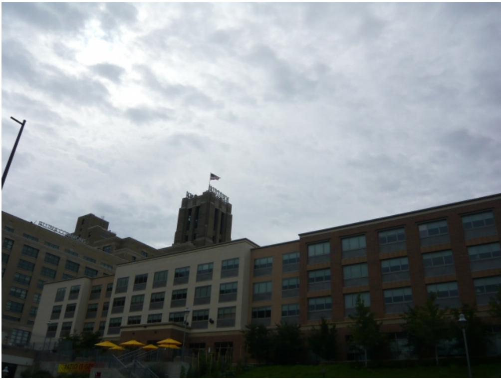
Here is a cafe and bike shop, only accessible along the Greenway trail.