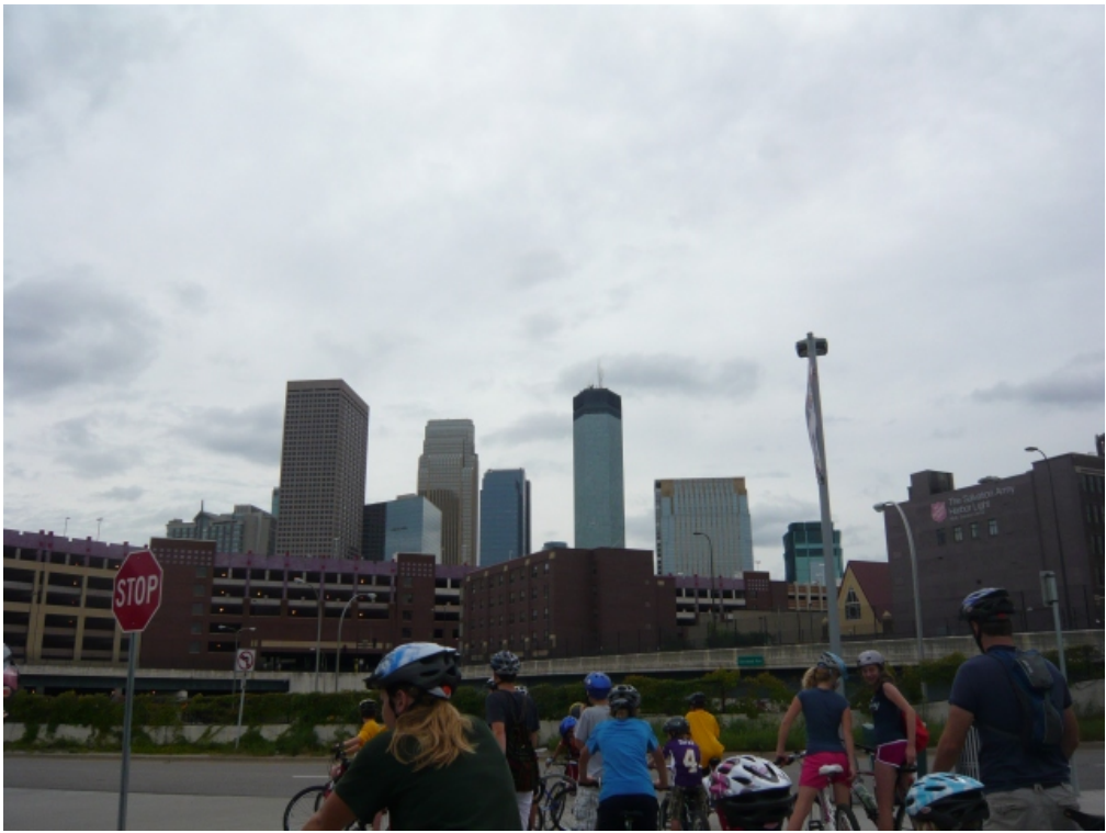
The crew, parking our bikes.