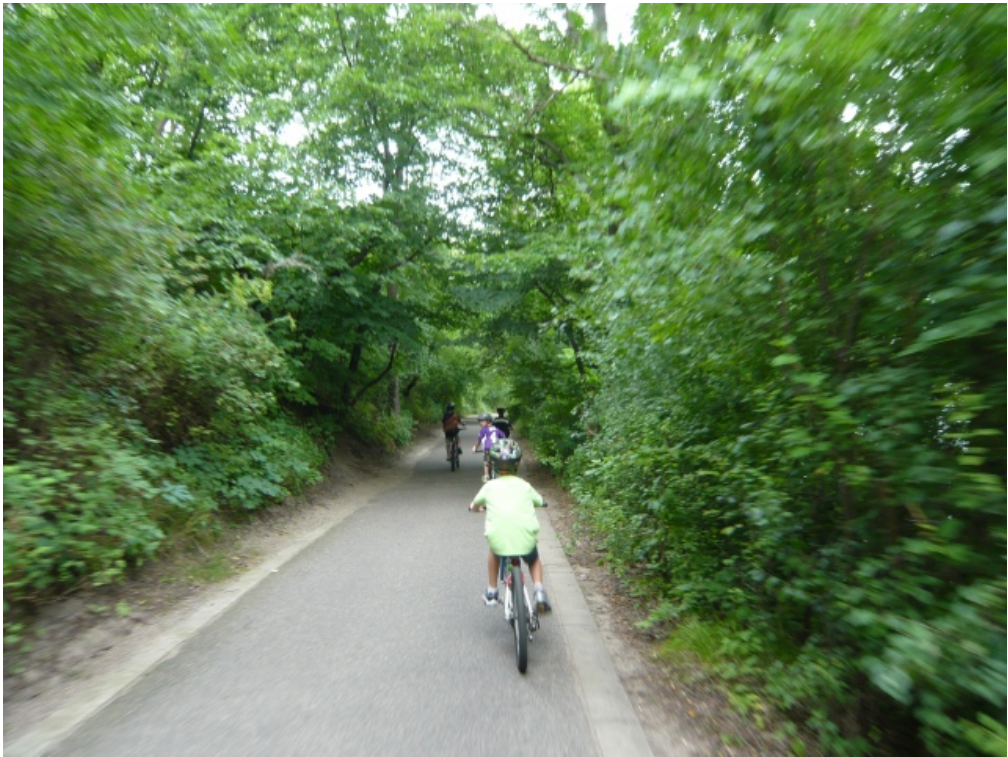
The view from Lake Calhoun of our destination, Minneapolis, in the distance. The sky looked threatening.