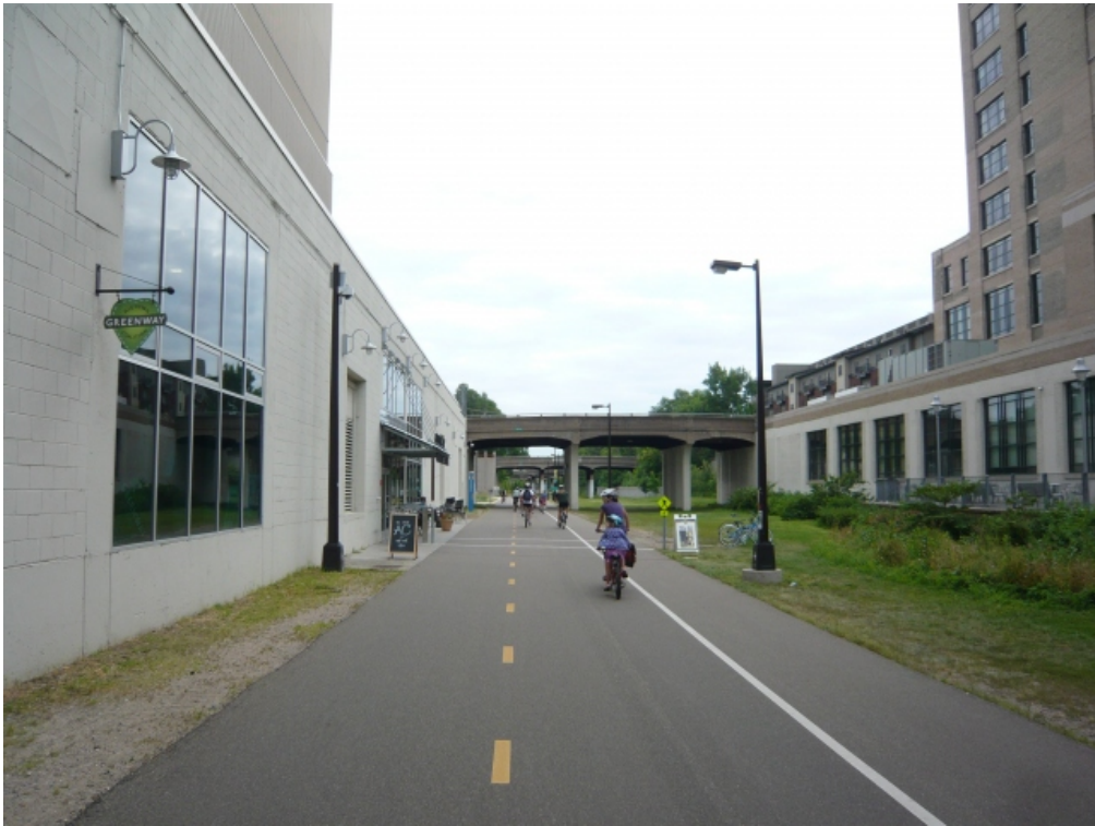
We went under many, many city street bridges.