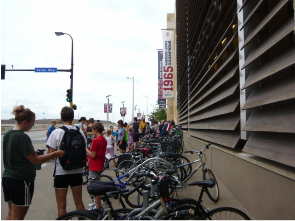
The Mill City Cyclomaniacs entering Target Field for our tour.