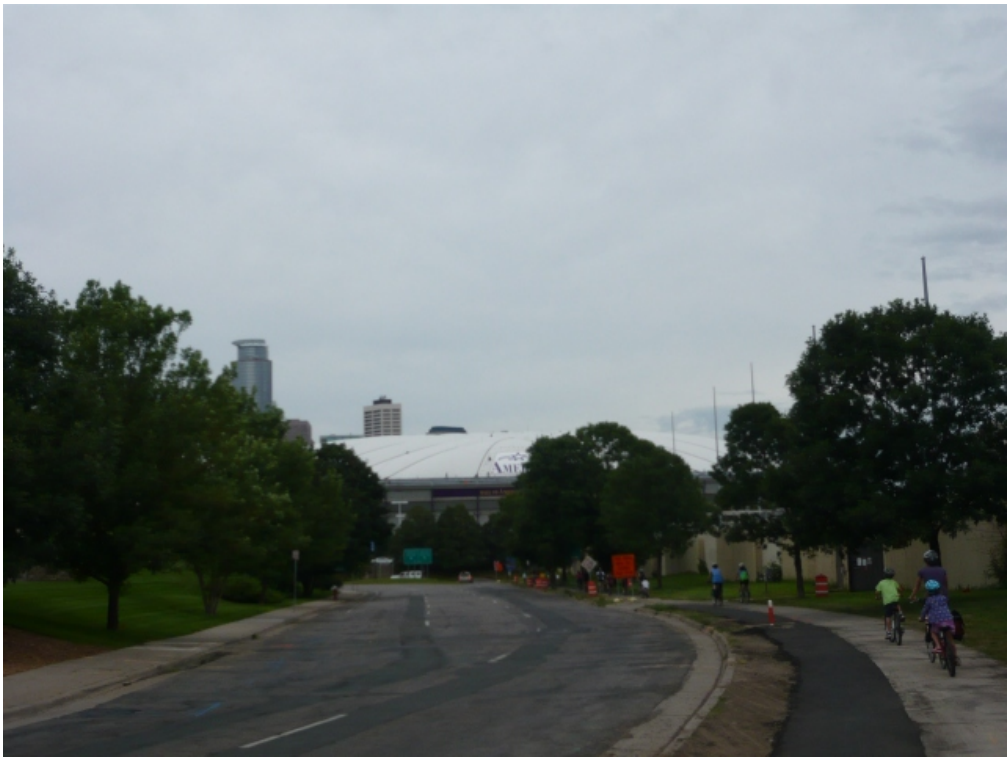
Then circled around the Mississippi River passing the Guthrie Theater and other cool landmarks.