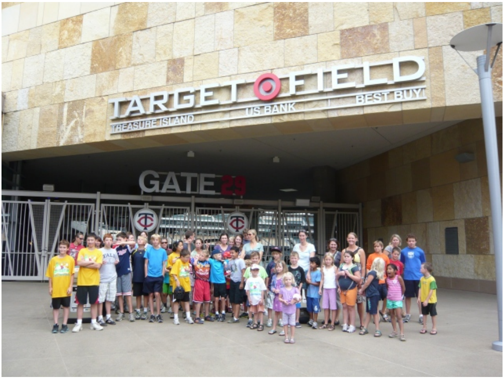
First sight of Target Field (only a year and a half old) and costing over 545 million dollars to build: