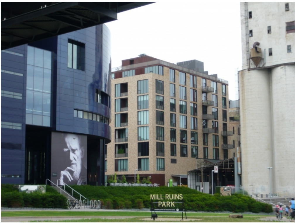
Remnants of the Old Mill City.